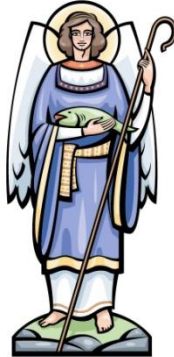
ST. RAPHAEL CATHOLIC CHURCH