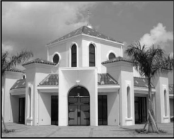
St. Raphael Catholic Church