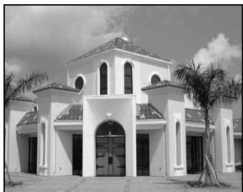
St. Raphael Catholic Church