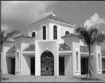
St. Raphael Catholic Church