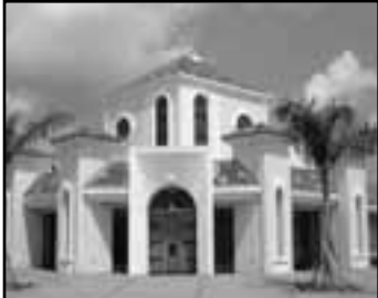
St. Raphael Catholic Church